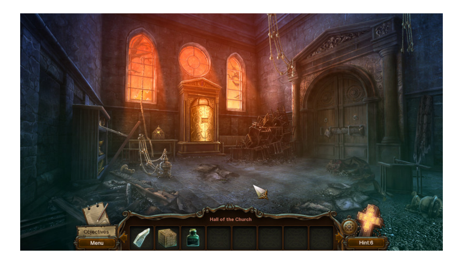
Download ->->-> http://bit.ly/2SKDgoN

Crossroad Mysteries: The Broken Deal Full Crack [Torrent]